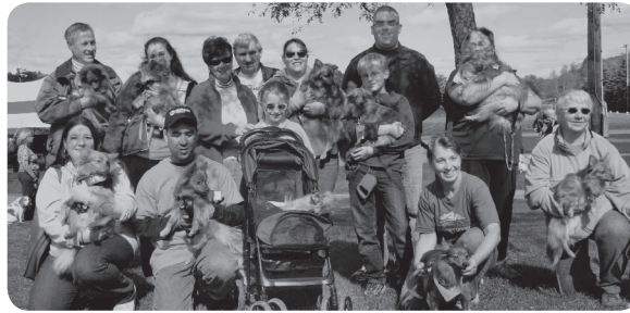
Pomeranian Alumni Photo Op! So great to see how well they are all doing – thanks to your support, we were there to rescue 76 Pomeranians in 2008. For more of that story, go to our website www.chenangospca.org and see our older Mew Barker newsletters.

On Saturday October 2, 2010 the shelter held its first ever “Did Somebody Say Walk?” Dog Walk and Alumni Parade. Attendees came in all shapes and sizes, all with four legs and plenty of fur. More than 60 of our woofing friends arrived with their human companions to join in the fun at Weiler Park in Norwich including many CSPCA Alumni (and a dozen of our Pomeranians that were rescued in 2008 – see photo.) Alumni received a special ribbon to wear on their collars during the walk.